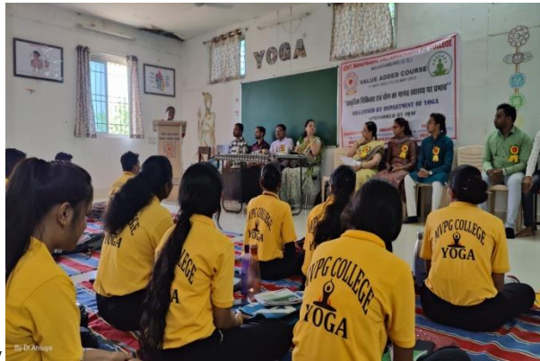
Value Added Course-Dpt. Of Yoga-2023