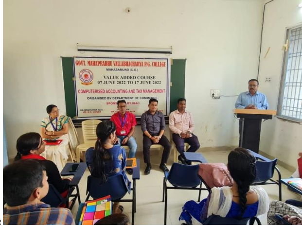
Value Added Course-Dpt. Of Commerce-2022